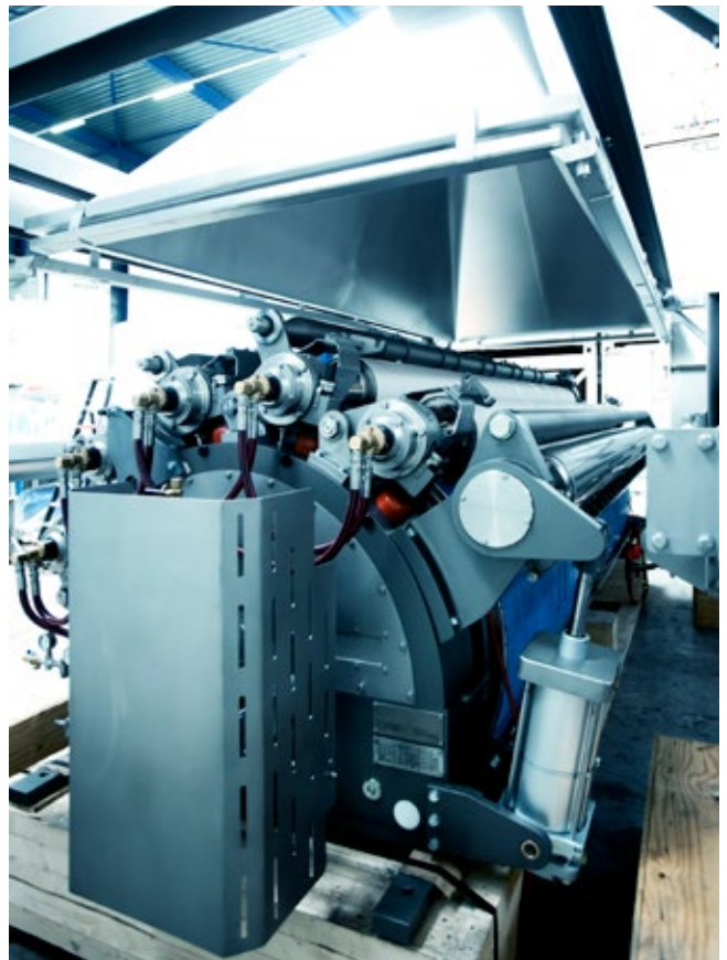
ANDRITZ Gouda single drum dryer